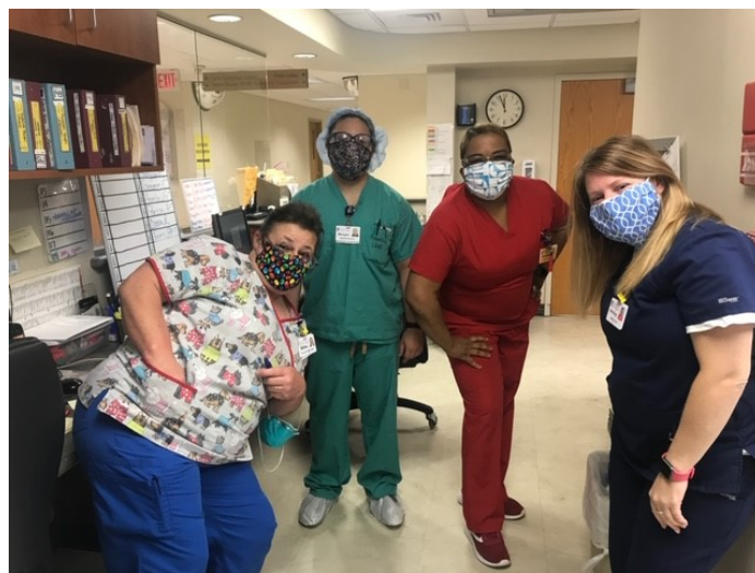
Nurses at Lane Hospital in Zachary, La