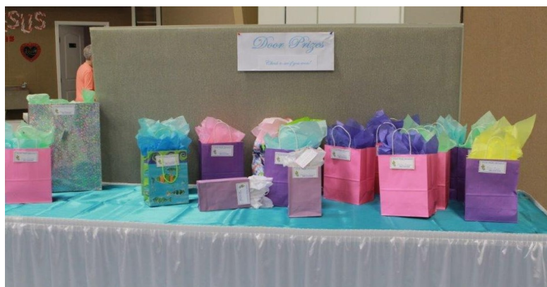
Door Prize table