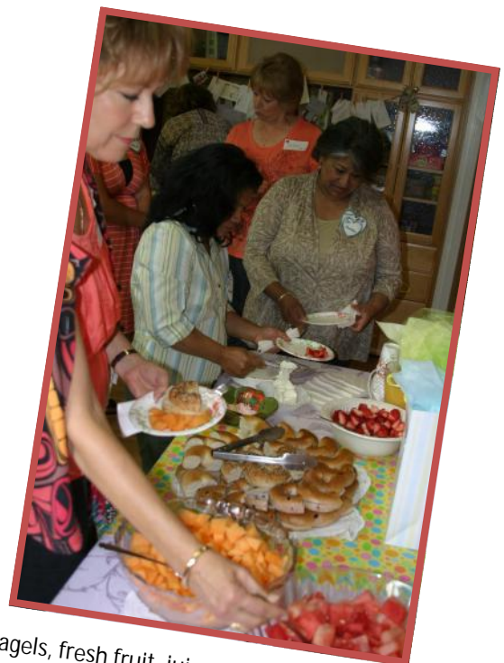
Bagels, fresh fruit, juice and coffee. Very simple

We strung a clothesline and put articles we make on it. It was also used for money and gift cards to be pinned on.