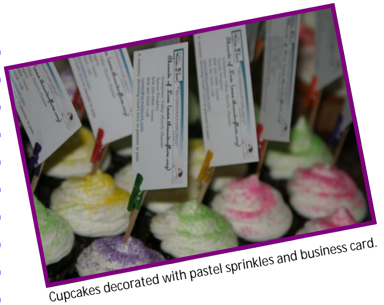
Cupcakes decorated with pastel sprinkles and business card.