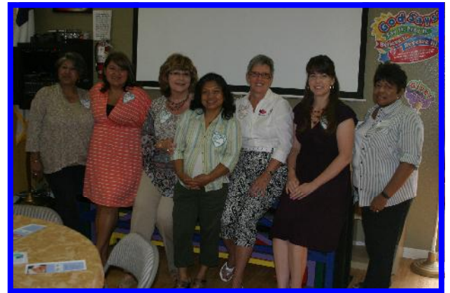
Some of our sewing ladies