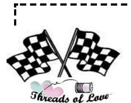
2010 NATIONAL CONVENTION AFRIL 22-25 - ROCK HILL SC "RACIN' INTO SPRING"